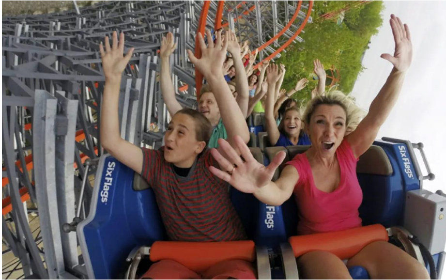
Selling sorted, baled recycled OCC in fall 2021