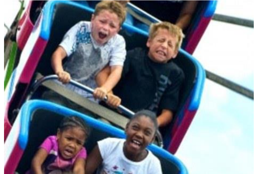
Selling sorted, baled recycled OCC in fall 2022